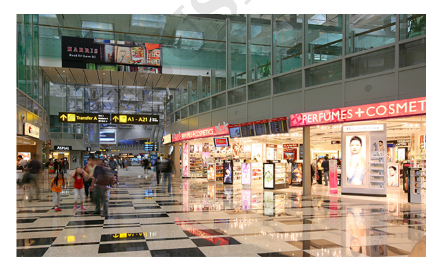
More than 80% of retail and food and beverage outlets at Changi Airport and Jewel Changi Airport have re-started operations.

On top of the GST absorption, the first 500 daily shoppers receive an additional S$10 cash-back with a a minimum spend of S$80 ($57) in a single, same-day receipt.