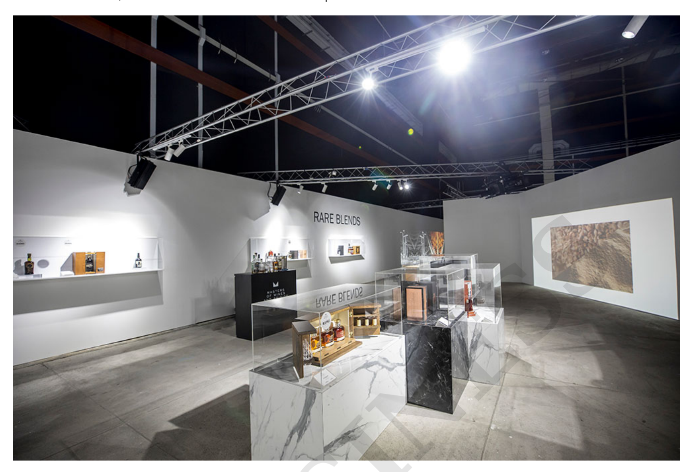
The whisk(e)y room at the 8th Masters of Wines & Spirits event in Singapore.

DFS Masters of Wines and Spirits is part of the DFS Masters Series, a program of exhibitions around the world which showcase products in the following categories: Wines and Spirits, Beauty and Fragrances, Watches and Jewellery.