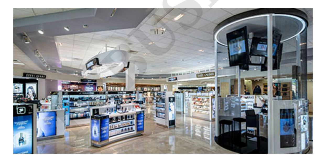
The DFS T Galleria in Beach Road, Garapan, Saipan.

Phase two then envisages the completion of a fully-integrated resort complex, including an amphitheatre, a shopping mall, park amusements and convention space, while phase three will see a multi-property expansion, featuring resort and condominium developments.