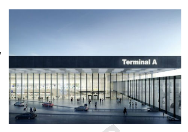
Schiphol Airports existing passenger capacity will rise by 14m annually when the new terminal opens in 2023.

The planned expansion forms part of the airports Capital Programme, which includes a new pier alongside the terminal opening.