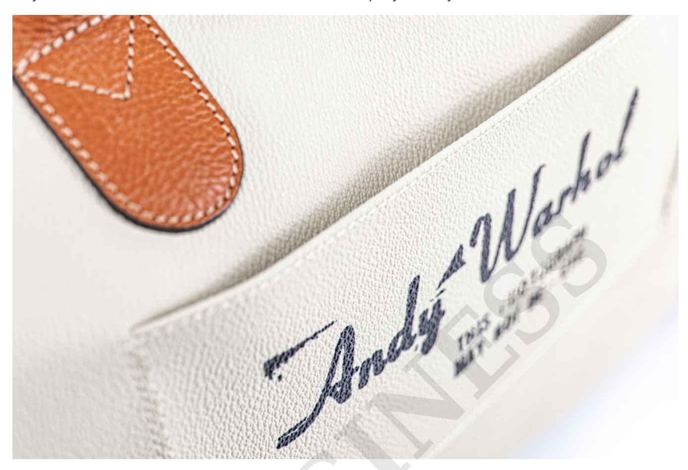
All the pieces in the collection are embellished with a stamp of Warhols signature.

The Limited Edition Collection Travel as Art comprises only 1952 pieces of both the Marilyn and Flowers adorned products, referencing the year that Bric's was founded.